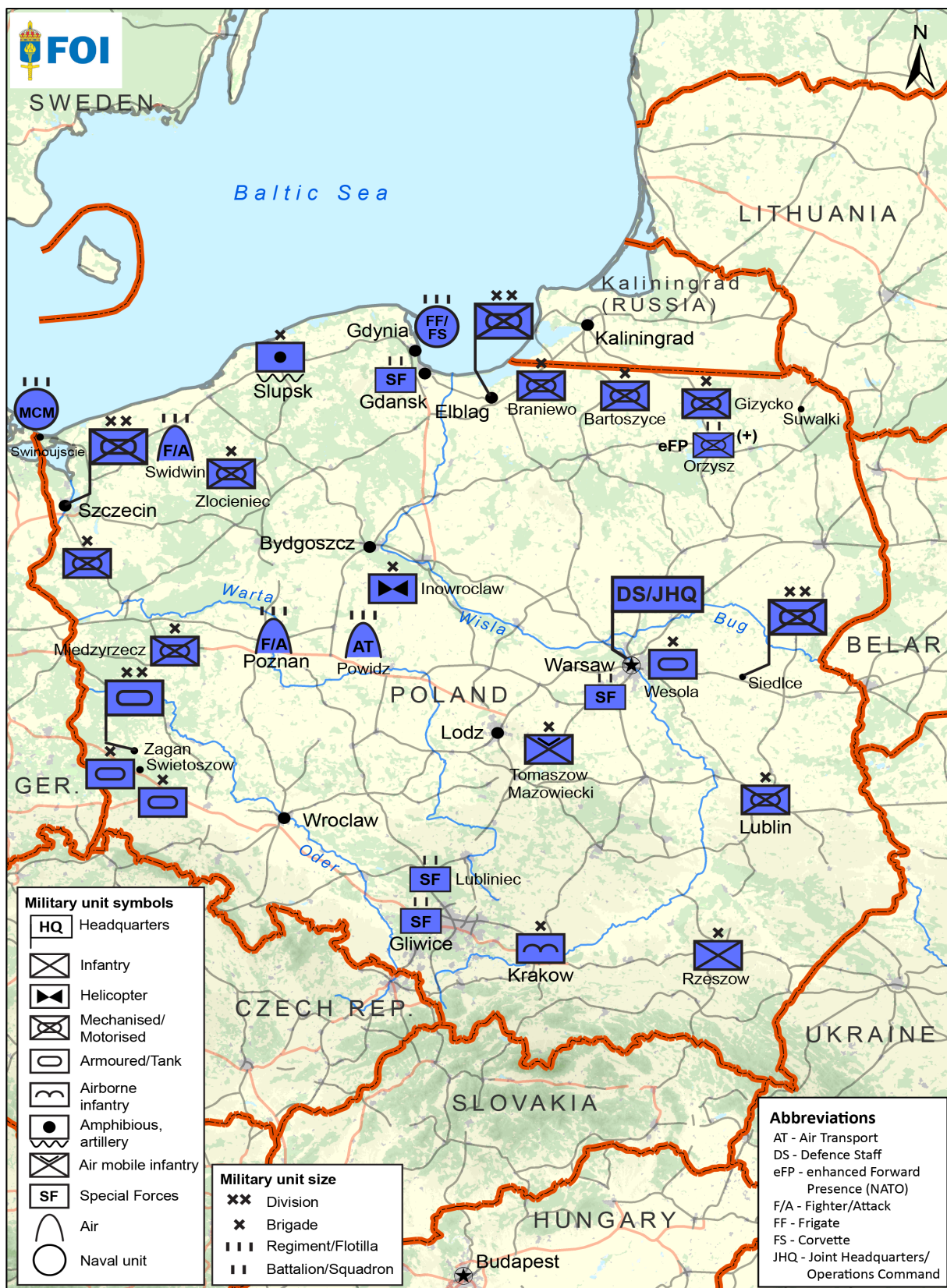
Map: Overview of Polish armed forces and their basing

NB: Design by Per Wikström. The map covers mainly operational headquarters and manoeuvre forces.